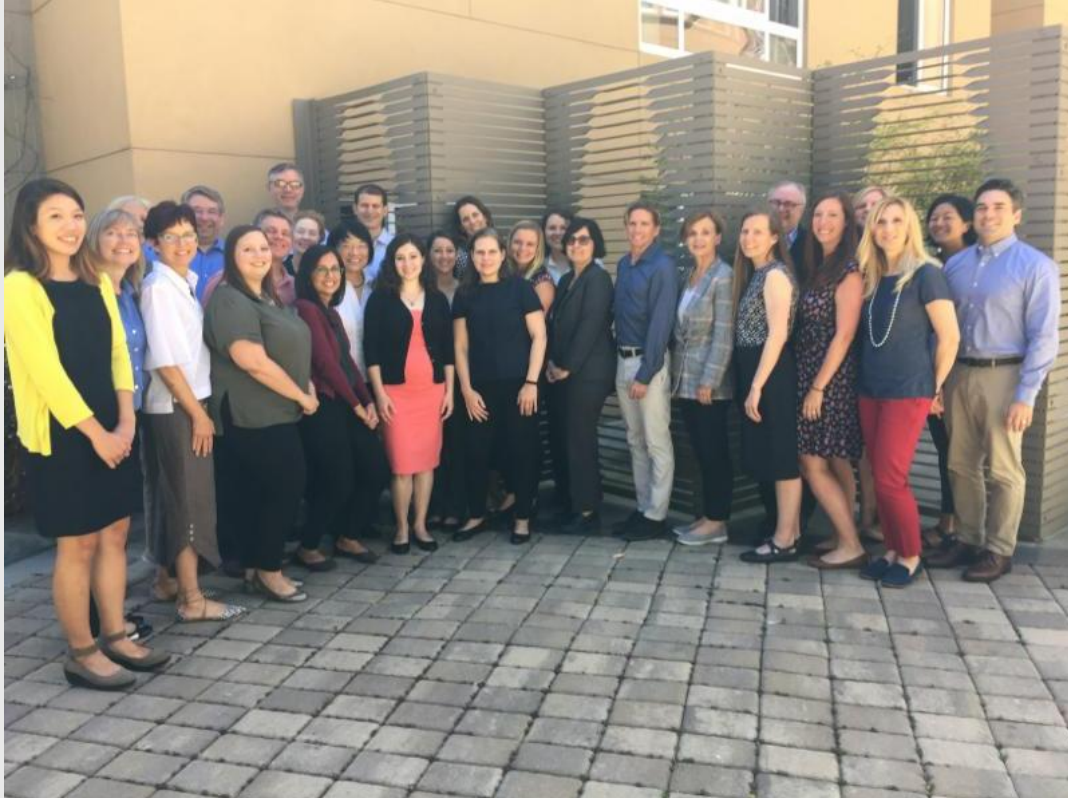
CHBRP's UC Faculty and Researchers convene in Berkeley, California on June 4, 2018, to discuss this year's bills and identify ways to improve its work.