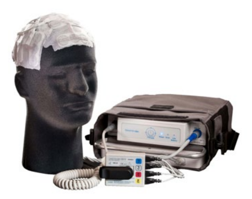
Figure 1. Optune® Device by Novocure