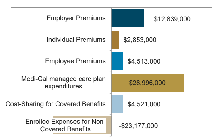
Figure B. Expenditure Impacts of SB 306