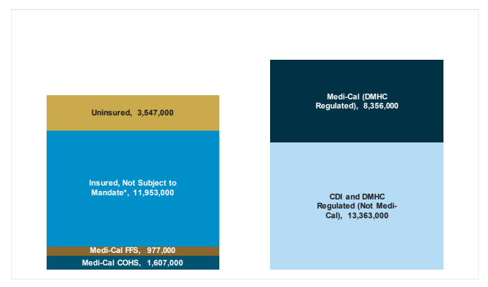
Figure A. Health Insurance in CA and AB 2144

Notes: * Medicare beneficiaries, enrollees in self-insured products, etc.